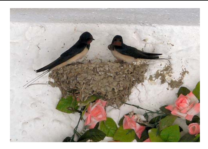
European Barn Swallow nest in Turkey, 2006 G. Oetzel