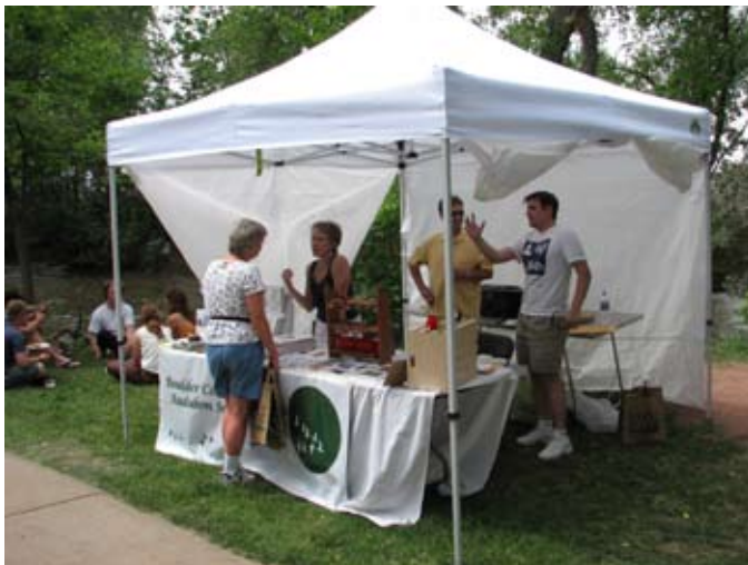
Boulder Creek Festival booth

BCAS ventured into new territory in May with a booth at the Boulder Creek Festival. The volunteers enjoyed the cover of the new tent that also protected the books, greeting cards, and other items that were on sale. Small toy birds that made appropriate calls when squeezed were popular with children. Sales were only part of the objective of the booth. In spite of heat and sometimes wind, many visitors stopped to talk with the volunteers to learn about Chapter activities. With migration in full swing, sharing stories of bird sightings was also popular. The Chapter thanks all the volunteers who worked over the Memorial Weekend allowing us to re-connect with our grass roots activism.