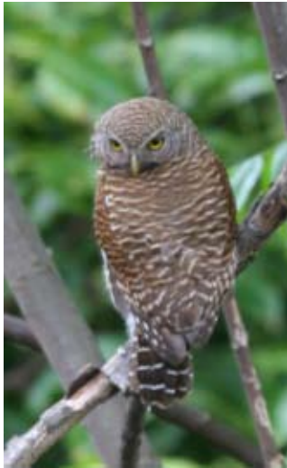
Asian Barred Owl