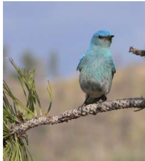
Mountain Bluebird More pictures: www.boulderaudubon.org