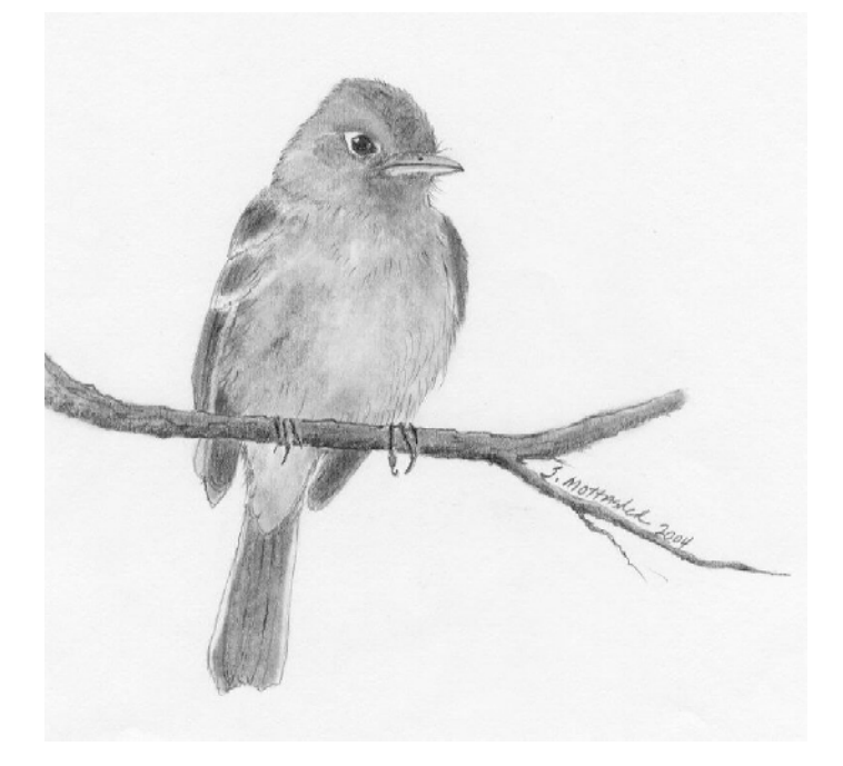
Empidonax Flycatcher — Susie Mottashed

Notable among the 48 species were a Sage Thrasher at Doudy Draw, immature Blue Grosbeaks, 9 Brown Creepers, and a flying Prairie Falcon.