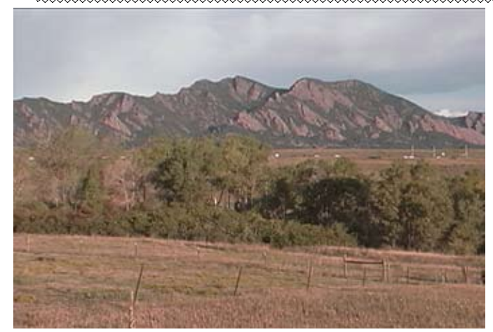
Coal Creek Scene from the video