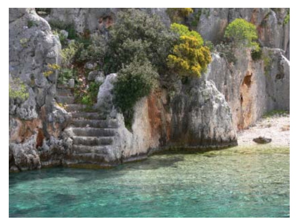
Ruins of Kekova-Simena, destroyed and submerged by earthquake in 2nd century AD.