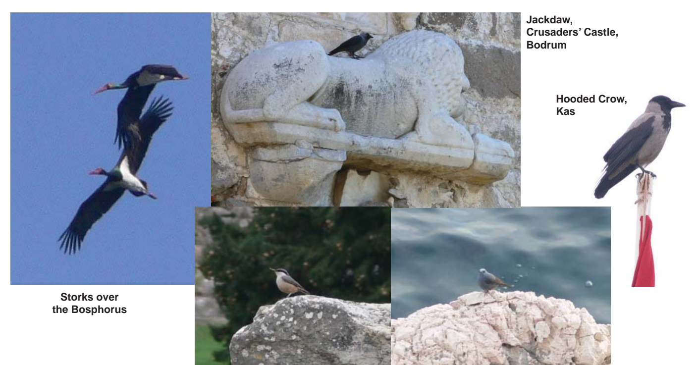
Rock Nuthatch, Ephesus