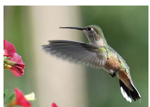
Female Broad-tailed Hummingbird, Longmont