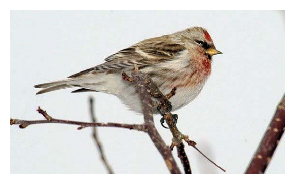
Common Redpoll - Bill Schmoker

Although local birds can fall back on backyard feeders, crossbills, grosbeaks, and other superflight species don't have that option. They live where there are few people and very few feeders.