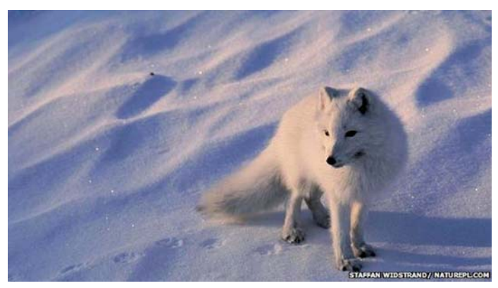
Arctic Fox. Figure and much of the text from http://www.bbc.co.uk/nature/20892310

Warmer conditions allow red foxes to travel further north as they are more likely to survive without the special adaptations of the Arctic species. People may also be an important factor. In the last 60 years many villages have been established in the Arctic and red fox benefit from scavenging at garbage dumps.