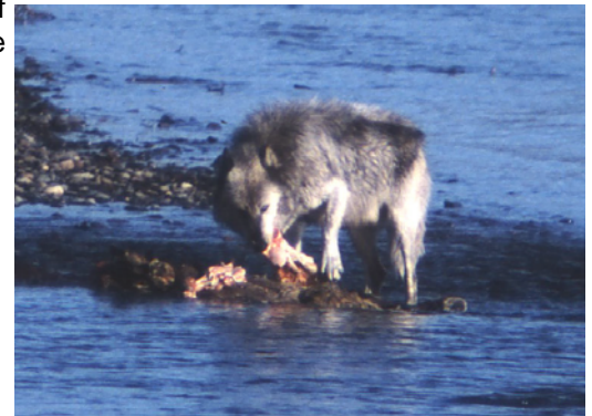
Druid Alpha male feeding

Wolves were reintroduced to Yellowstone National Park during 1995 and 1996. Since then, they have flourished, although controversy continues. Wolf photos include those of the famous alpha, 21M, at kill sites with his Druid pack in the Lamar Valley. Other inhabitants shown include Grizzlies prowling, River Otters frolicking, Bald Eagles usurping, and other animal activity in Yellowstone.