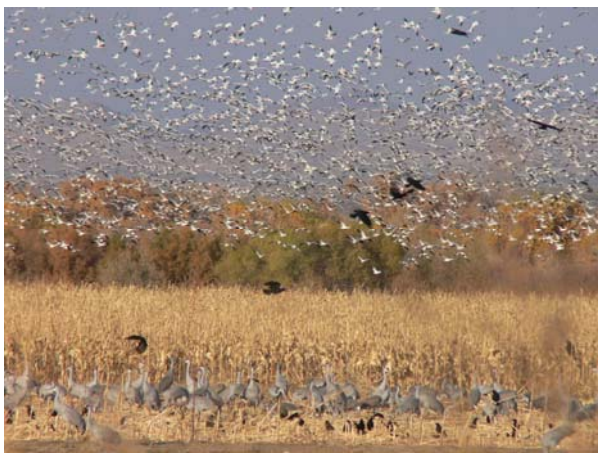
Cranes & Snow Geese, Bosque del Apache, Nov 2007

Kochia ( Kochia scoparia ) is the most widespread resistant weed of Colorado. [2]