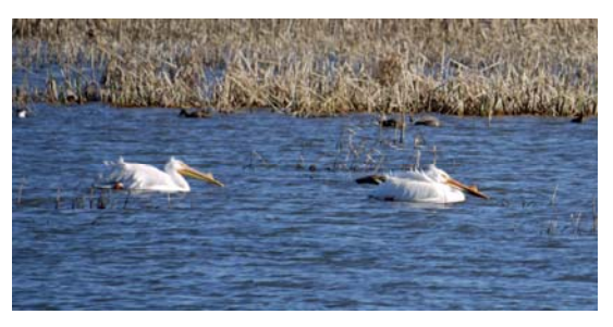
White Pelicans and Blue -wing Teal from BCAS trip to Cheyenne Bottoms and Quivira, April 2011

Other vignettes that we will hold in our memories: -dozens of avocets busily sweeping the water around placidly sleeping white pelicans -snow geese descending in the evening like sprinkles of silver confetti behind vast clouds of their gray brethren (White-fronted Geese). -skeins of geese crisscrossing the crescent moon as deep darkness came down around us. -a family of three Whooping Cranes—our last sight on the morning of our departure—with the adults framing the young "colt" and taking to the air in silence and grace. After we left we learned that sixteen had been seen before the next great storm hit Kansas.