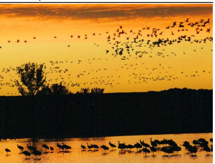
Cranes and geese at sunrise-G. Oetzel

www.ncdc.noaa.gov/oa/climate/research/2008/ann/bams/