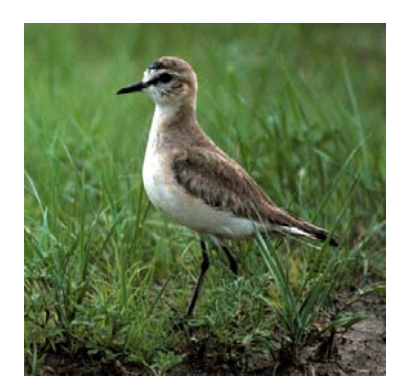
Mountain Plover

Note: Boulder County Nature Association offers scholarships to defer part or all of class tuition. For more information, visit www.bcna.org