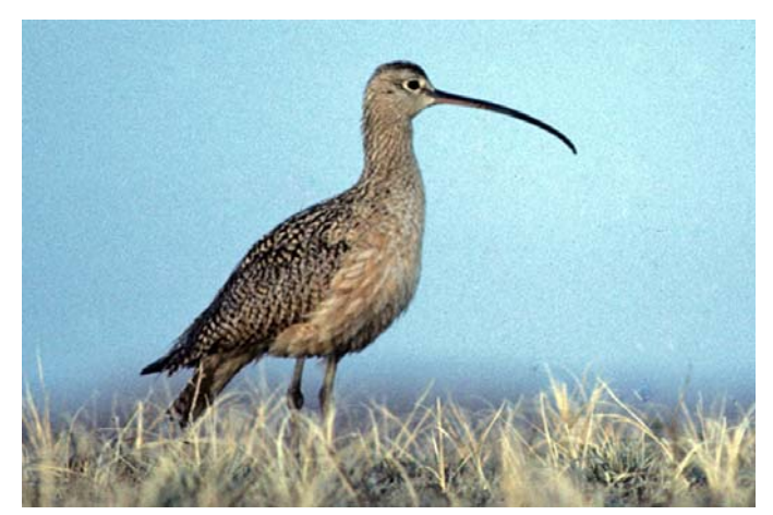
Curlew at dawn — Steve Jones

Given the proximity of some nesting populations to Boulder (Continued on page 4)