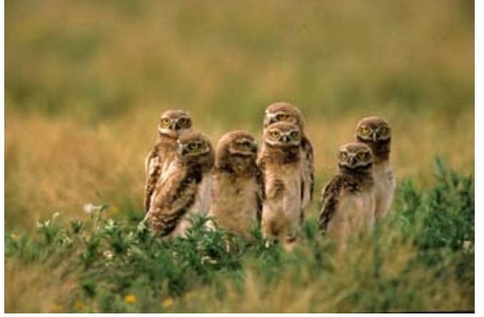
Burrowing Owl Family