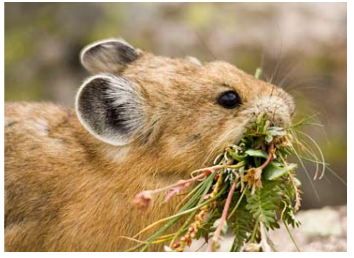
Busy Pika

[Article adapted from original email to hiking group]