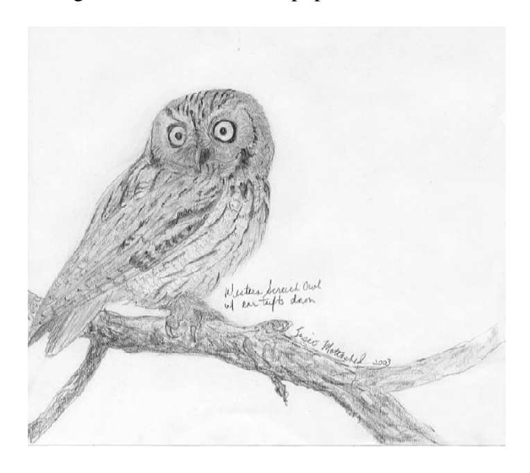
Thanks Susie Mottashed for the Screech Owl with its tufts down, and also for the Red-tailed Hawk on page 4.

The full 234-page report is available in PDF format (2.5 MB) at http://www.whitehouse.gov/omb/inforeg/2003_cost-ben_final_rpt.pdf