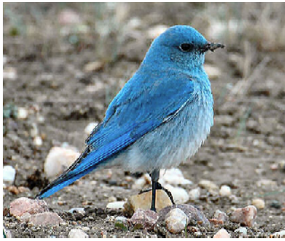
Mountain Bluebird