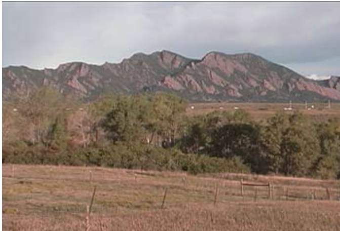
Coal Creek Scene from the video