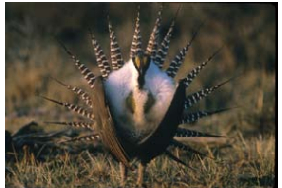
Gunnison Sage-Grouse