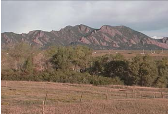
Coal Creek Scene from the video