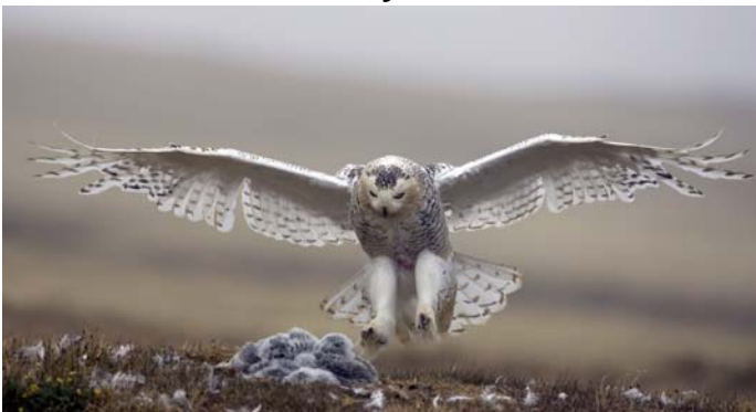
Photo by Paul Bannick, from The Owl and the Woodpecker . See the June program description, page 1.