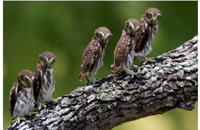
Ferruginous Pygmy Owl Chicks