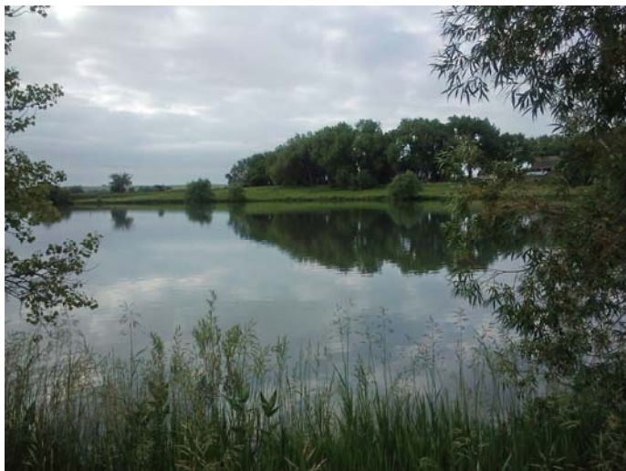
Dodd Reservoir, June 2010—Petrea Mah

If you can help contact Petrea Mah petrea-mah@comcast.net or Nancy Neupert nancyn@earthlink.net or just show up on June 5 th . Meet in the Dodd Reservoir parking lot on Niwot Road around 1.25 miles east of 63 rd .