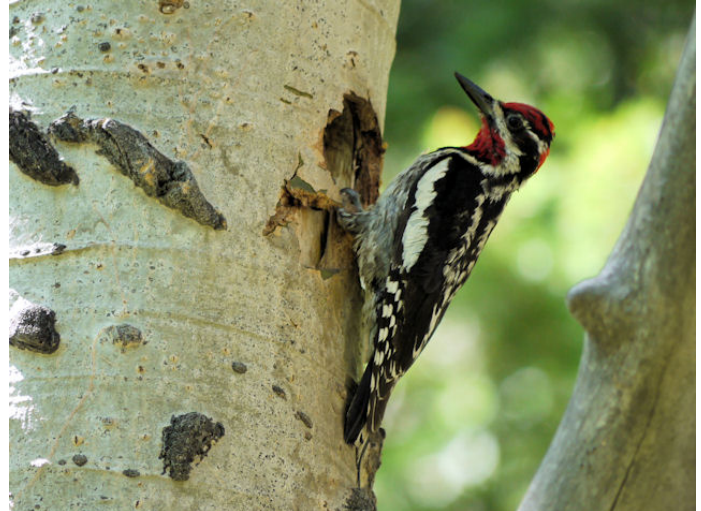
Red-naped Sapsucker, Meyers Gulch