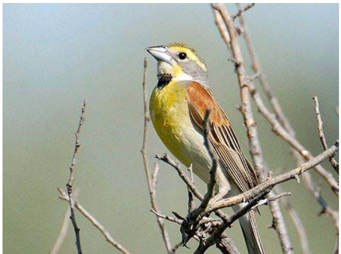
Dicksissel