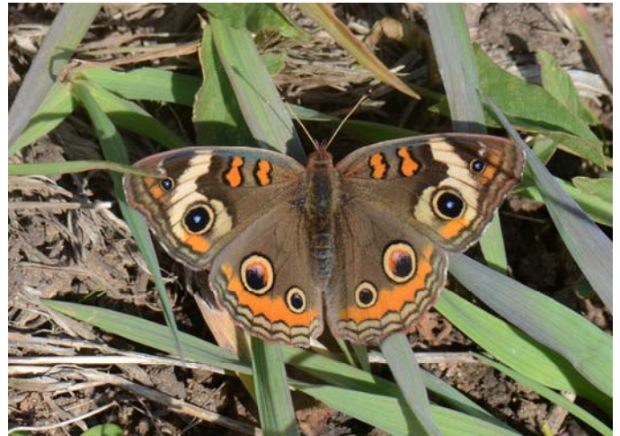
Common Buckeye, Shanahan Ridge

Our butterflies faced another challenge in September, when a year's worth of rain (more than 17") fell on Boulder during less than a week. Just as the rains began to subside, we were astonished to see moths and butterflies flying around; and orange sulphurs, dainty sulphurs, variegated fritillaries, common buckeyes, and common checkered-skipper were flying over our grasslands and visiting our gardens through November. Through it all, we've been astonished by the resilience of our precious flying jewels.