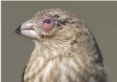
The eyes of this female House Finch are swollen by disease.

This special push to track both sick and healthy House Finches is being carried out through the Cornell Lab's Project Feeder Watch, an annual winter survey of feeder birds that runs from November through April. New participants are invited to sign up