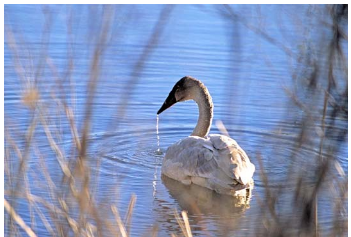
Trumpeter Swan at Marshall Ponds