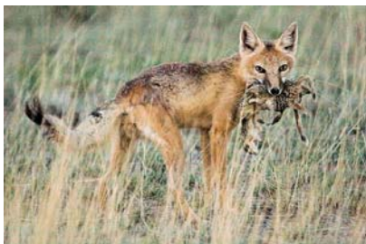
Swift Fox with Ground Squirrel