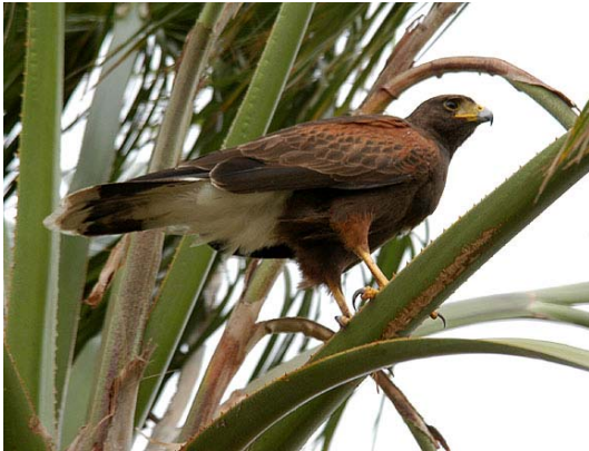
Harris's Hawk in TX

Edited from New York Times article , Dec 22. For more, see http://tinyurl.com/c3t4nhb