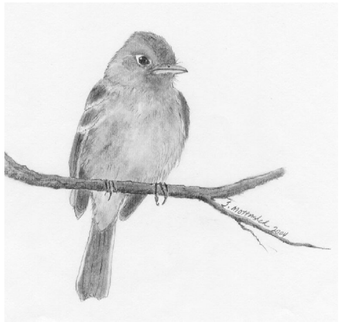
Empidonax Flycatcher — Susie Mottashed

Notable among the 48 species were a Sage Thrasher at Doudy Draw, immature Blue Grosbeaks, 9 Brown Creepers, and a flying Prairie Falcon.