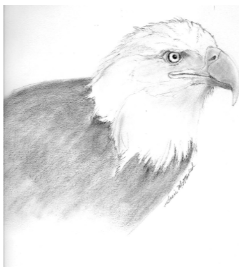
Bald Eagle—Susie Mottashed