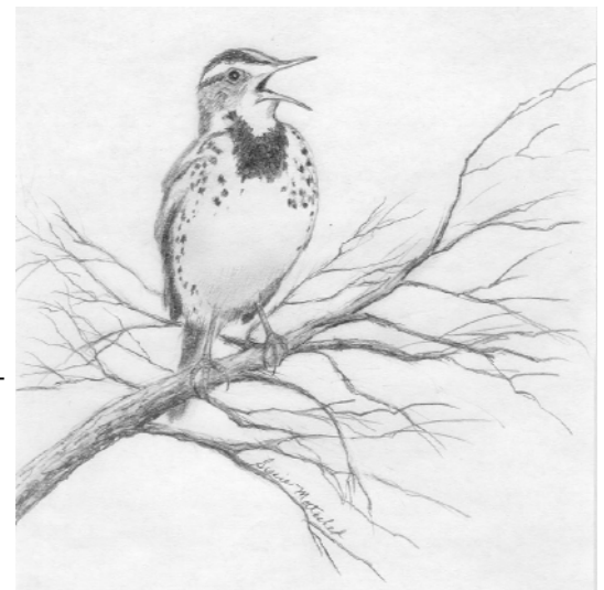
Western Meadowlark—Susie Mottashed

May 8 (Sat) 8am-10:00am (field trip) Cottonwood Marsh at Walden Ponds