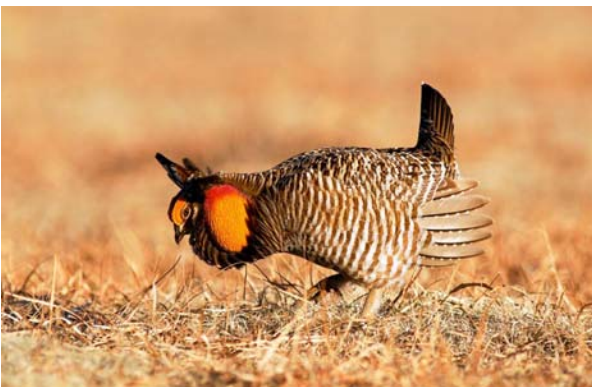
Greater Prairie Chicken