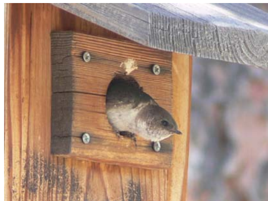
Violet-green Swallow chick in nest box, expecting an adult to feed it without landing.

The Audubon Society and many other organizations have stressed numerous times that conservation is the "low-hanging fruit" in the effort to minimize global warming. While it sometimes seems that it's difficult for us as individuals or families to conserve significantly, it's worth remembering that there are times when we can see very real personal benefits from the effort in the form of reduced costs.