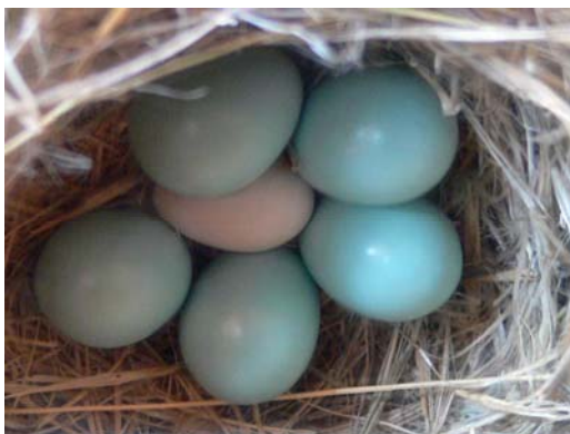
Nest with 5 Western Bluebird eggs and one Violet-green Swallow egg.

Both species continued to be interested in that box. Shortly after the WEBLs fledged, we found one egg of each type in the box. On the next check, there were 5 WEBL eggs and one VGSW egg, as in the picture below. The WEBL chicks fledged successfully. When we cleaned out the box, we found the unhatched VGSW egg. The Cornell Lab overview of WEBL says that VGSW have been observed defending WEBL nests and helping with feeding. However, our observations at Betasso certainly look more like competition than cooperation. ( www.birds.cornell.edu/AllAboutBirds/BirdGuide/Western_Bluebird.html )