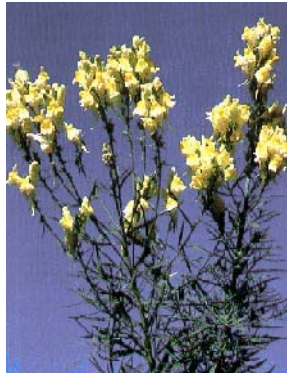
Yellow Toadflax

What distinguishes noxious weeds from other plants is that they are not native to the United States. They grow unchecked by natural predators and enemies such as insects or diseases. In their native environment, these forces prevent the plant from becoming a problem.