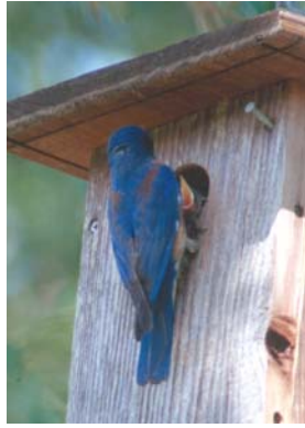
Western Bluebird feeding chick