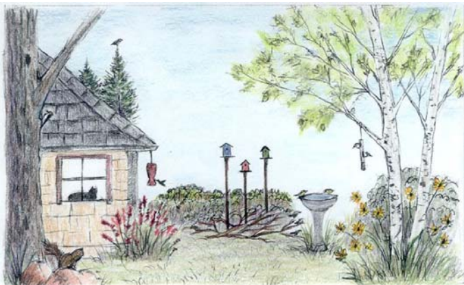
Backyard Wildscape—Susie Mottashed

Visit our Web site for more details on the upcoming June publication event!