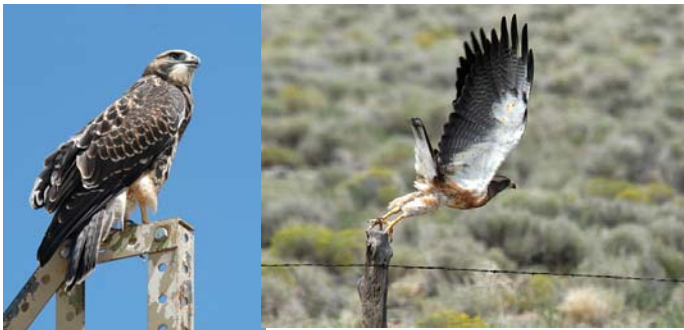
Swainson's Hawks

Unitarian Universalist Church, 5001 Pennsylvania Avenue, Boulder (off 55th St. between Arapahoe and Baseline)