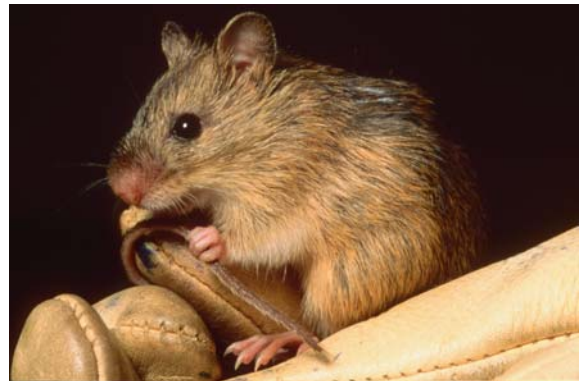
Preble's meadow jumping mouse in hand. Note the long tail and large hind foot