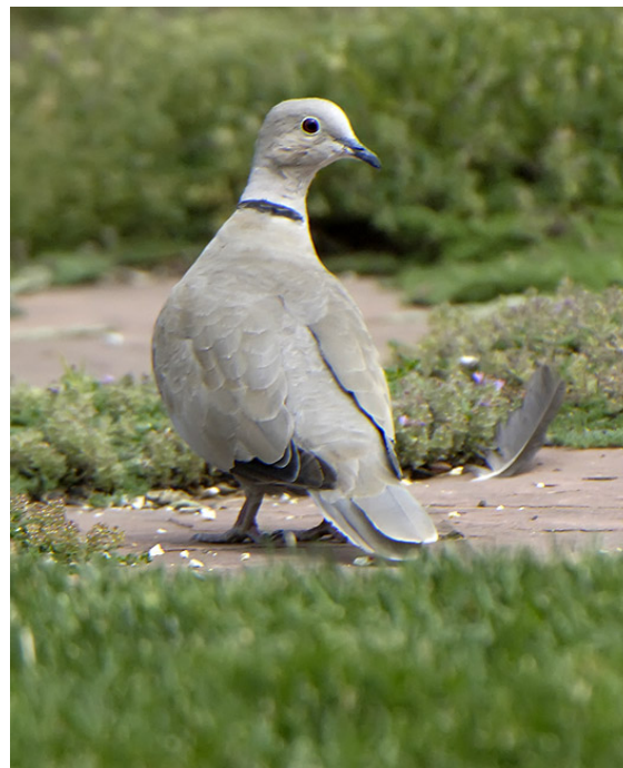
Eurasian Collared Dove — Bill Schmoker