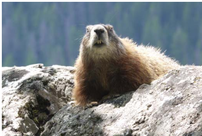
Yellow-bellied marmot—G. Oetzel