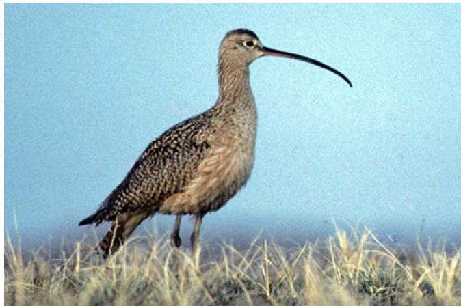
Curlew at dawn