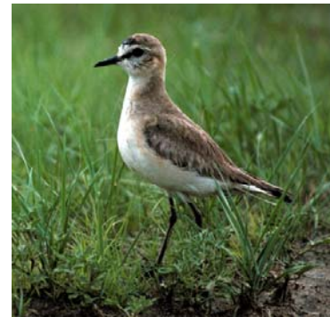
Mountain Plover

Note: Boulder County Nature Association offers scholarships to defer part or all of class tuition. For more information, visit www.bcna.org