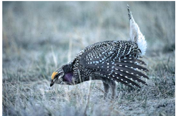
Sharp-tailed Grouse

Make checks payable to Boulder County Audubon Society and mail to BCAS Coupons, 2385 Vassar Dr, Boulder, CO 80305-5726