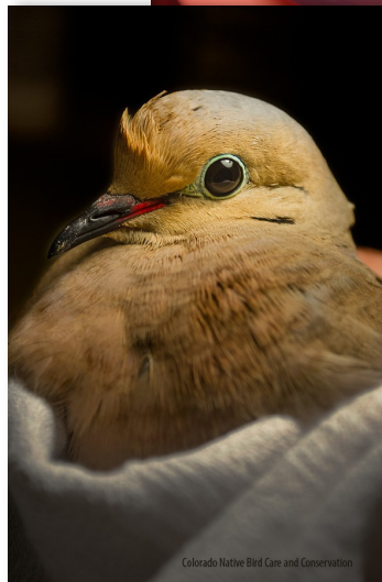
Colorado Native Bird Care and Conservation

Two of Colorado Native Bird Care's patients from this spring/summer season: a Big Brown Bat and a Mourning Dove, who somehow survived a cat attack. (They treat many cat attack birds.) CNBCC has rescued and rehabilitated more than 200 birds and mammals this year: check out their website for more info and to make a donation! They rely solely on funding from the public.