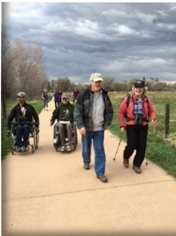
Boulder Audubon led the annual Roll and Stroll hike at the Bobolink Trail in Boulder on April 23. Approximately 15 people attended. This trip was a collaboration between BCAS and OSMP.

The least we in the U.S. can do is love and care for our cats indoors, where they live longer, healthier lives, and can watch birds with us—from inside the window, where their whiskery “kill reflex” looks kind of cute, like a sneeze.