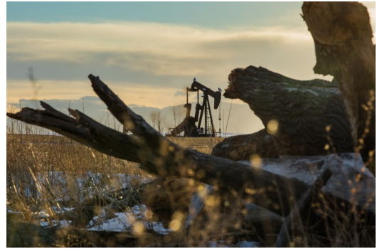
Dec 15 th , 2015. Seven days after the nest was toppled; the pair perch on pumper behind the toppled nest tree.

On December 15 th , a friend and fellow photographer inquired about an old growth cottonwood near Erie, CO that had previously housed a bald eagle nest. He informed me that the big cottonwood was lying on the ground, along with several neighboring trees. After a number of phone conversations with state and federal regulatory agencies, I was surprised to learn that eagle nests could be legally removed or “taken” via the permitting system of US Fish and Wildlife (FWS). The Erie nest was permitted in order to build 2,200 homes on this undeveloped square mile tract. I was determined to find out what would come of these two bald eagles, and to also gain a thorough understanding of USFWS’s eagle permitting system. In the months after their nest was toppled, I spent numerous hours documenting and photographing this bald eagle pair. I am convinced that their story also speaks for the remainder of nesting eagles in Colorado’s Front Range, and their need for continued protection.