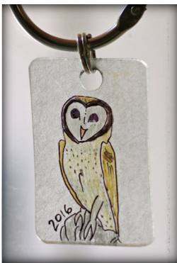
Tiny creation: Barn Owl zipper pull

(2016 BCAS Conservation Awards, cont'd.)