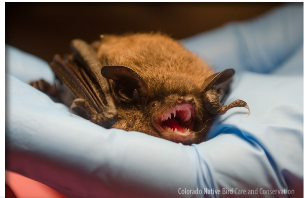
Colorado Native Bird Care and Conservation