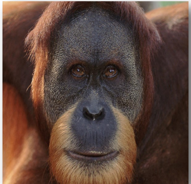
Sumatran orangutan.

Cindy Cossaboon has been a zookeeper with great apes at the Denver Zoo for over 16 years. She is also an elected member of the orangutan Species Survival Plan steering committee.