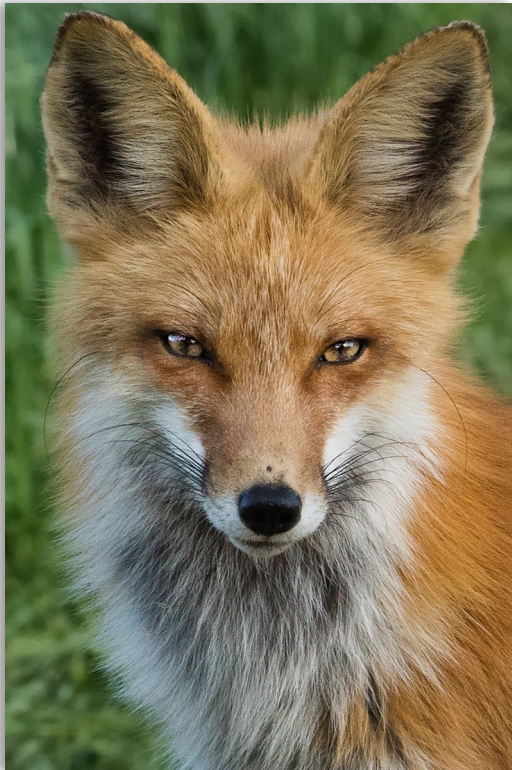
Red fox. Photo © Dana Bove. All Rights Reserved.