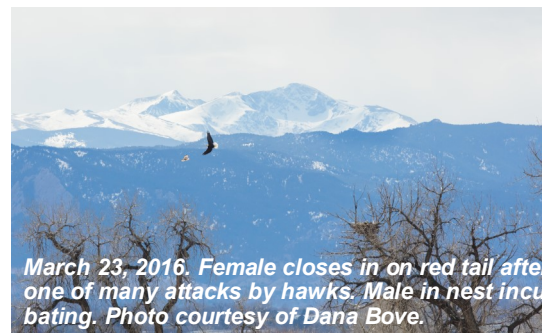
March 23, 2016. Female closes in on red tail after one of many attacks by hawks. Male in nest incubating.

While there is a wealth of experiences to share from my observation of these two eagles, I’ll focus here on the challenges this nesting pair faced from burgeoning development in this part of Weld County. While the rural landowner and adjacent farmers welcomed the new nesting pair, actual and potential disturbances seemed to arise on a regular basis: target shooting with automatic weapons near the nest tree; natural gas drilling; a planned equestrian center nearby; coyote hunting and potential lead poisoning; and a track mounted excavator working at the base of the tree during incubation. Natural disturbances included constant bombardment by a pair of red tail hawks nesting nearby. The new nest failed after 55 days of faithful incubation. The pair was last seen about a week after the failed incubation, flying east after another round of relentless attacks by the nesting red tail hawks.