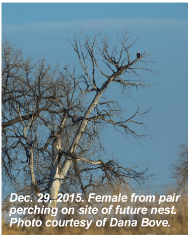
Dec. 29, 2015. Female from pair perching on site of future nest.

A few days after the nest was removed, a friend and I visited the site of the toppled nest tree. There were at least three old growth cottonwoods on the snowy ground, and it was clear that the nest tree was the eldest and most weathered of them all. We spotted the displaced eagles on opposite ends of an oil pumper, just beyond the hulk of the toppled nest tree. Several days later, on a visit to the old nest site, we spotted the pair flying southwest, and followed them to a site about 2 miles from the former nest. We were delighted to find both bald eagles the next day near where they disappeared the previous evening. The female was roosting near the top of a weathered old growth cottonwood, while the male was in an adjacent cottonwood. A new nest began to take shape in that old cottonwood during the next month.