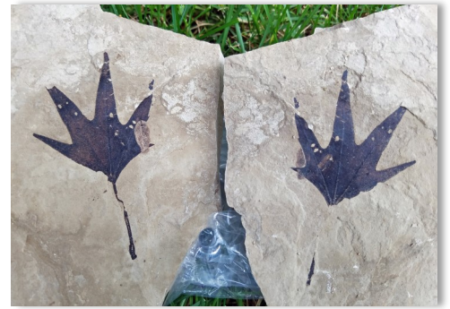
Double leaf print fossil.

We learned to split the thin shale layers with a rock hammer and rock chisel, and to inspect both split faces with a hand lens. What ancient wonder would be revealed when we peered into rock for the first time in 50 million years? As our rock-splitting skills developed, so did our discernment about which finds to keep and which to classify as “leaverite”—as in, leave ‘er right there.